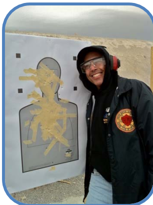
Notice the smiley face Mark shot out at 7 yds