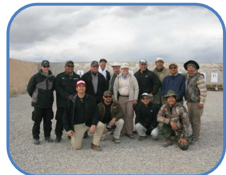
Our group of divers

Here are some recent pictures from Front Sight, firearm training facility in Pahrump, Nevada. We had a handful of Neptunes out there, honing their skills. Timing worked out fine, rain and heavy winds in L.A. = no spearfishing so defensive handgun skills sounded like a great idea. A good time was had by all. If anyone is interested in the future, contact me upesce@msn.com and I might be able to get you a free four day course.